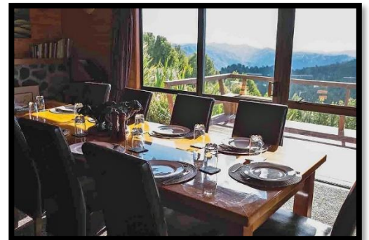
VIEW FROM THE LODGE